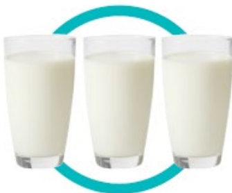
600 mL of milk