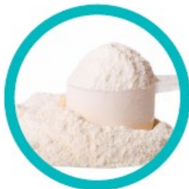
21 g whey protein