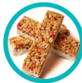
1 protein bar of 80 g (check the nutritional table)