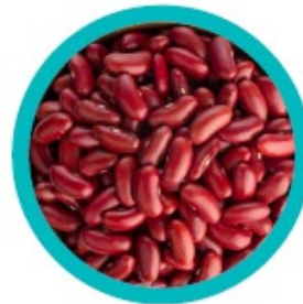
250 g red beans