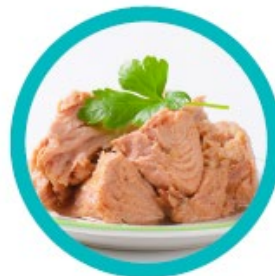
80 g water canned tuna