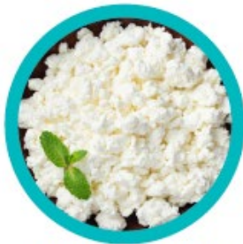
176 g cottage cheese