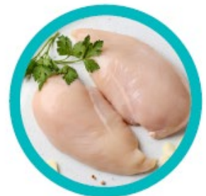
80 g turkey breast