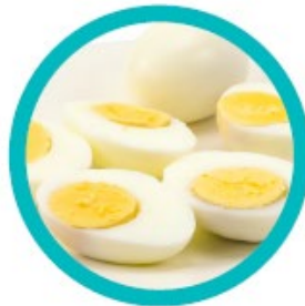
3 whole eggs