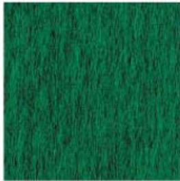
Carpet to rent, bright gre...