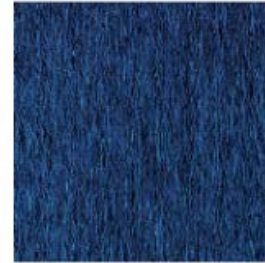
Carpet to rent, blue