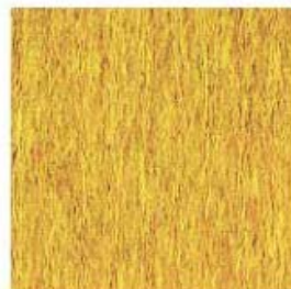
Carpet to rent, yellow