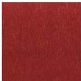
Carpet to rent, red