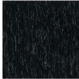
Carpet to rent, black