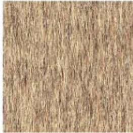
Carpet to rent, beige