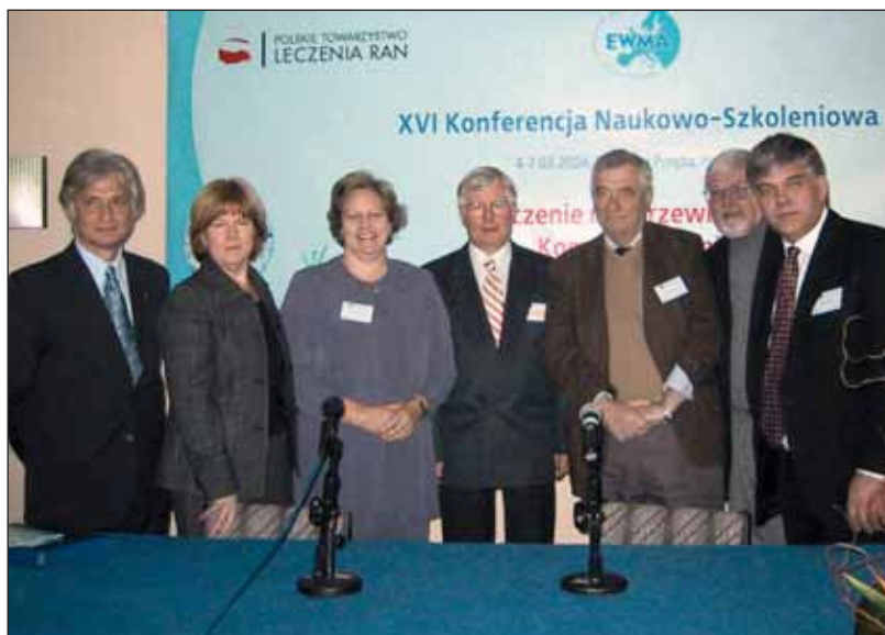
PWMA held their first Wound Management Conference as a joint meeting with the 16th Phlebological Conference in Szklarska Poreba.

EWMA congratulates AWA with a successful annual meeting in Graz.