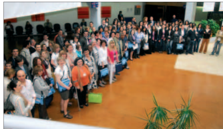
The UCM Group

In the light of the epidemiological, financial and human costs associated with wound management, there is a need for practitioners to have in depth knowledge and skills in the provision of effective, efficient, evidence-based practice for individuals suffering from the most common chronic wounds encountered. The EWMA UCM aims to achieve this by providing a medium where students, from a wide variety of clinical backgrounds and cultural experiences, can come together to hear, confront and debate the latest evidence in wound care. This unique learning experience strengthens the link between theory and practice, facilitating the development of enhanced skills and knowledge in chronic wound management. We look forward to seeing you in Helsinki in May 2009 where you can share in this highly rewarding experience. ■