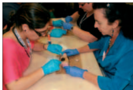
Participants practising on pigs' feet at the debridement workshop.

EWMA was delighted to see a total of 110 students from teaching institutions in Belgium (Centre of Continuing & Professional Development), Ireland (Royal College of Surgeons Ireland), Portugal (Universidade Atlântica, ESS Setúbal and Universidade dos Açores), Switzerland (Haute école de Santé, Geneva) and the United Kingdom (University of Hertfordshire) undertake the EWMA UCM in Lisbon 2008.